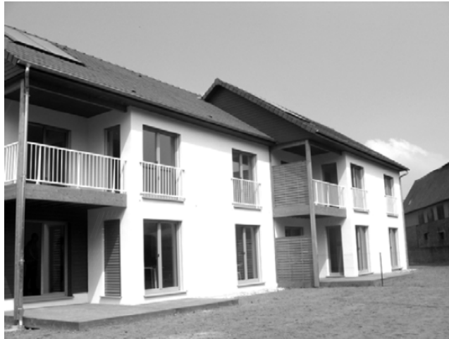
Figure 1: General view of the two houses (Arch.: En Act architecture, contractor: les Airelles)

The building under study is a group of two attached houses built in 2007 in Picardy region, France (Figure1). These houses are the first “Passive-House” buildings in France [1, 8].